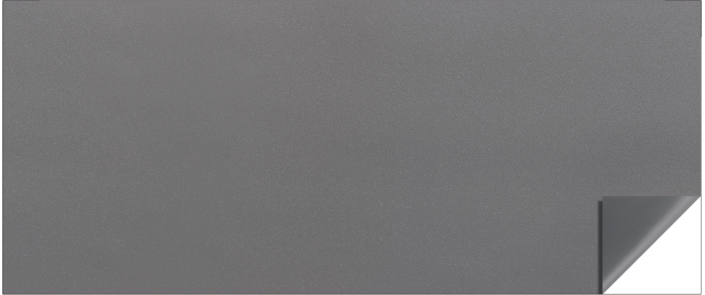
Grigio / Grey