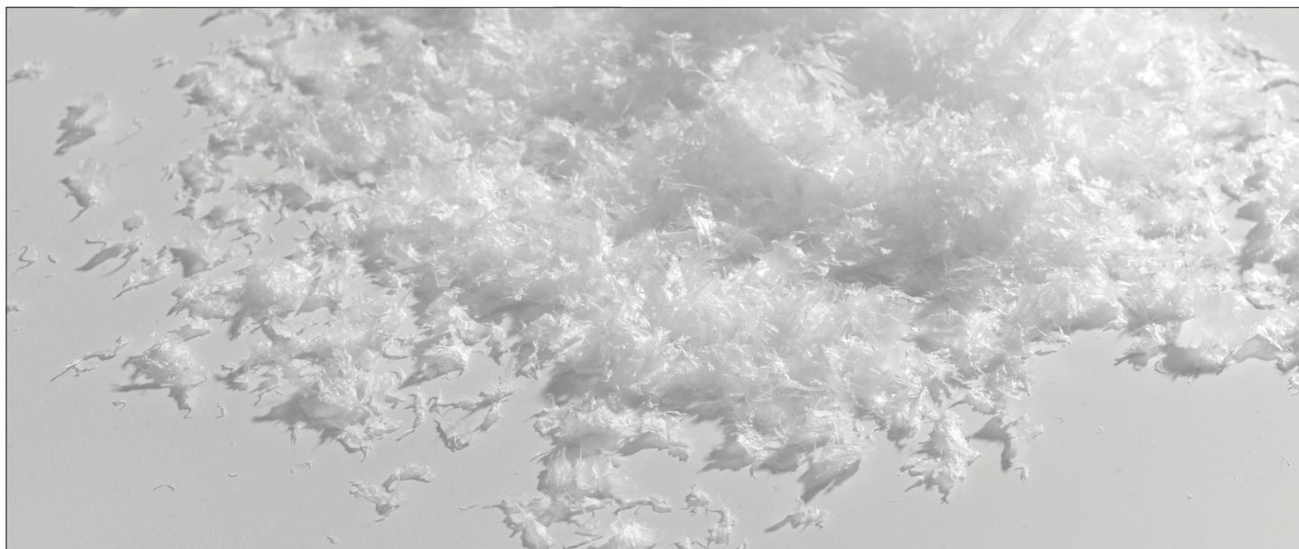
Bianco / White